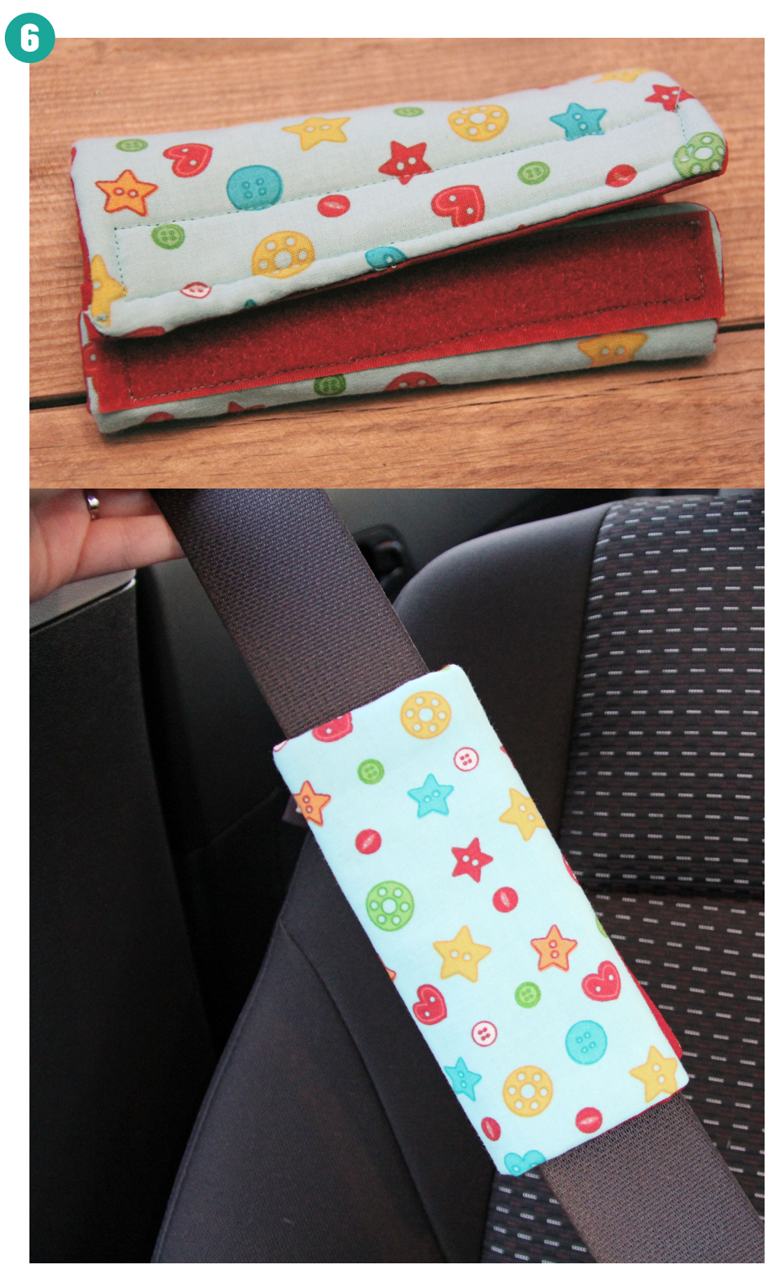
After the velcro is attached, your cozy is ready to wrap around your vehicle's seat belt!