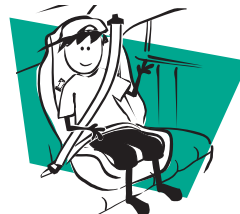
High back booster